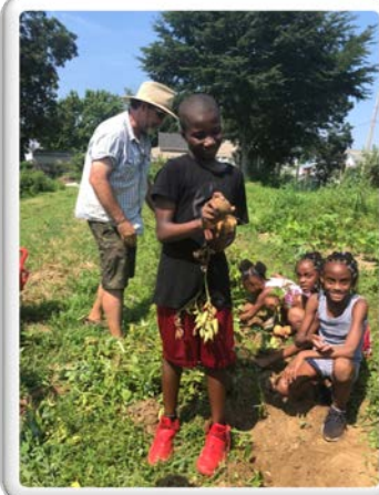
Easton Boys & Girls Club